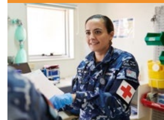
Healthcare, Science & Chaplaincy