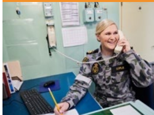
Business, Administration & Education