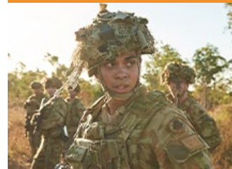
Combat & Security